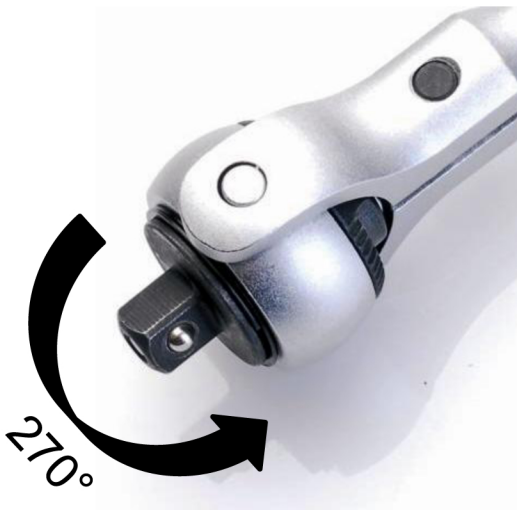
Swiveling head, Fixable